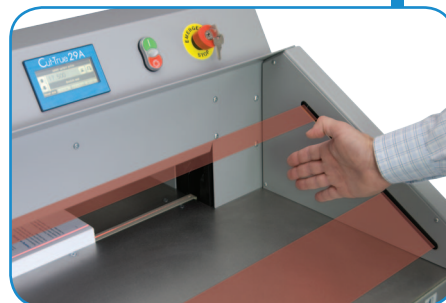
Infrared Safety Curtain shuts down operation if the beam is interrupted