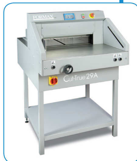
Standard model, without optional wide side tables

MyBinding.com 5500 NE Moore Court Hillsboro, OR 97124 Toll Free: 1-800-944-4573 Local: 503-640-5920