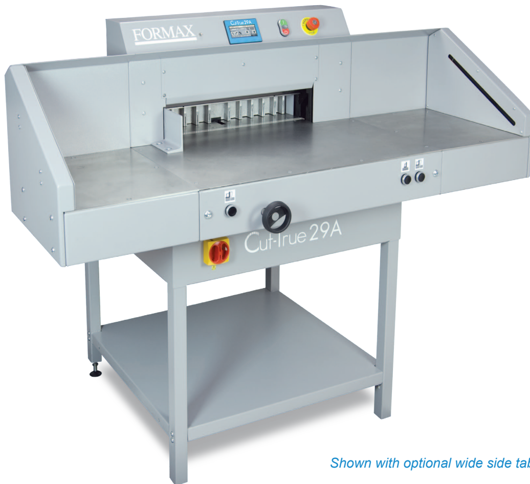
Shown with optional wide side tables

The Formax Cut-True 29A Electric Guillotine Paper Cutter offers precision cutting for paper stacks up to 20.5" wide. User-friendly, intuitive features include a touchscreen control panel, automatically-adjusting back gauge and the capacity to program up to 100 jobs/100 cuts . An infrared light beam safety curtain provides safety and convenience as it shuts down operation if the light plane is interrupted.