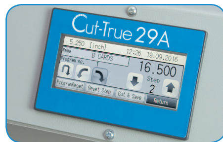
Touchscreen Control Panel allows for programming up to 100 jobs